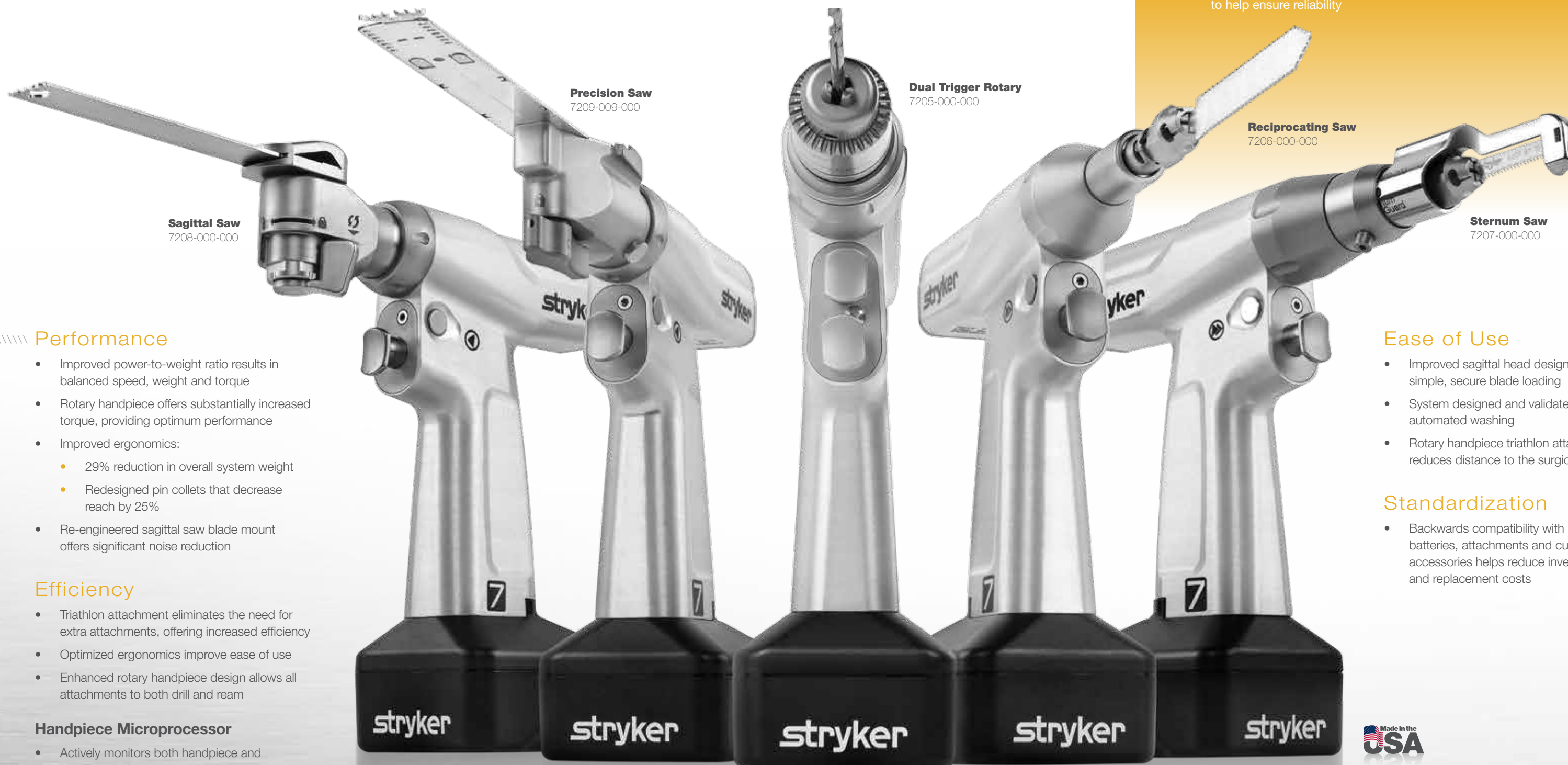
Sagittal Saw 7208-000-000