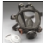
7800S Small 7800S Medium 7800S Large