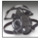
7001 Small 7002 Medium 7003 Large