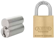
83 Series Cylinder Insert