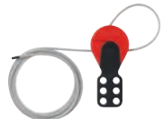
C503 Safelex™ LO