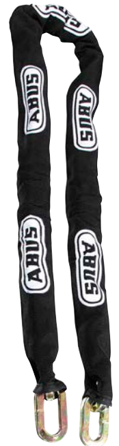
10KS Chain & Sleeve