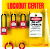
K980 Small Board

Compact stations that organize and store lockout devices. Easily accessible so workers have access to devices in maintenance and repair situations.