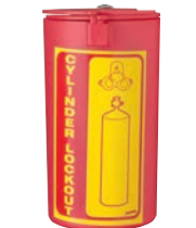
P606 Gas Cylinder LO