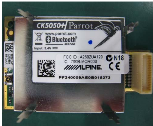
Fig 1. Bottom View of Bluetooth Module “PF240009”