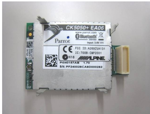
Fig 1. Bottom View of Bluetooth Module “PF240028”