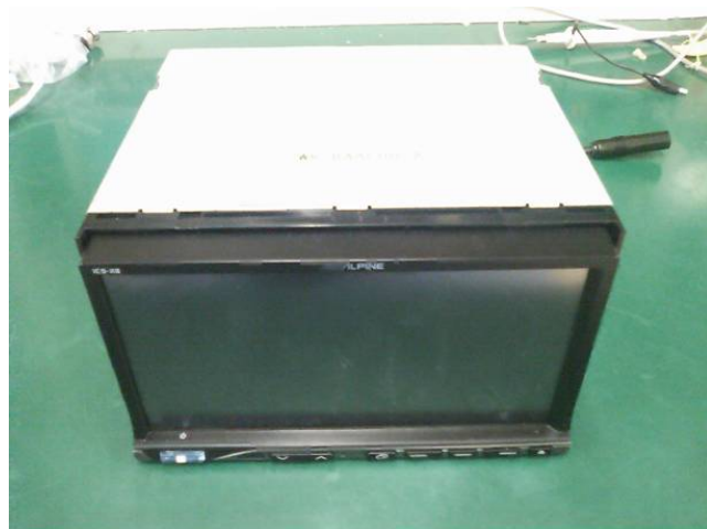
Fig 2. Top View of ICS-X8 that installed Bluetooth PWB “ICS-X8 BT PWB”