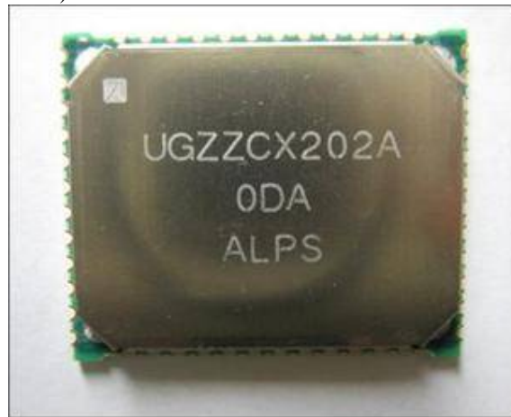
Fig 1. Top View of Bluetooth part “UGZZC-202A”