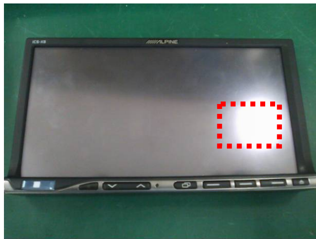
Fig 2. Front View of Display unit that installed Bluetooth part “UGZZC-202A”