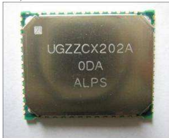
Fig 1. Top View of Bluetooth Transmitter “UGZC-202A”