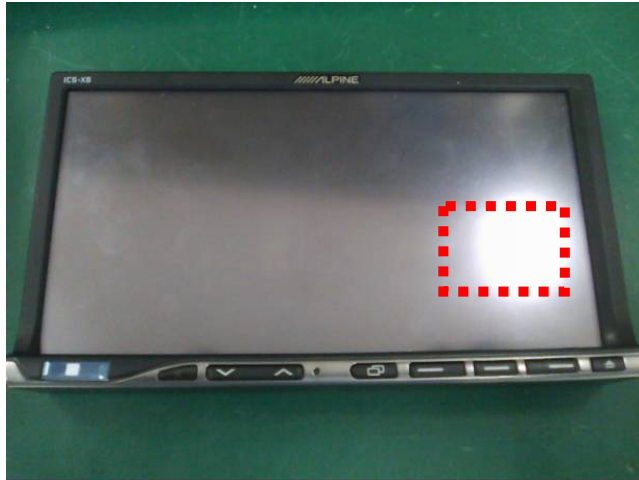
Fig 3. Front View of Display unit that install “ICS-X7 BT PWB”