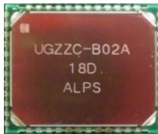
Fig 1. Top View of Bluetooth Transmitter “UGZZC-B###”