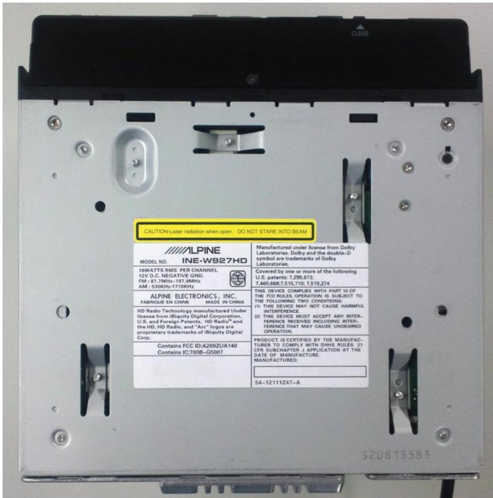
Fig 5. Bottom View of Product that installed Product Label