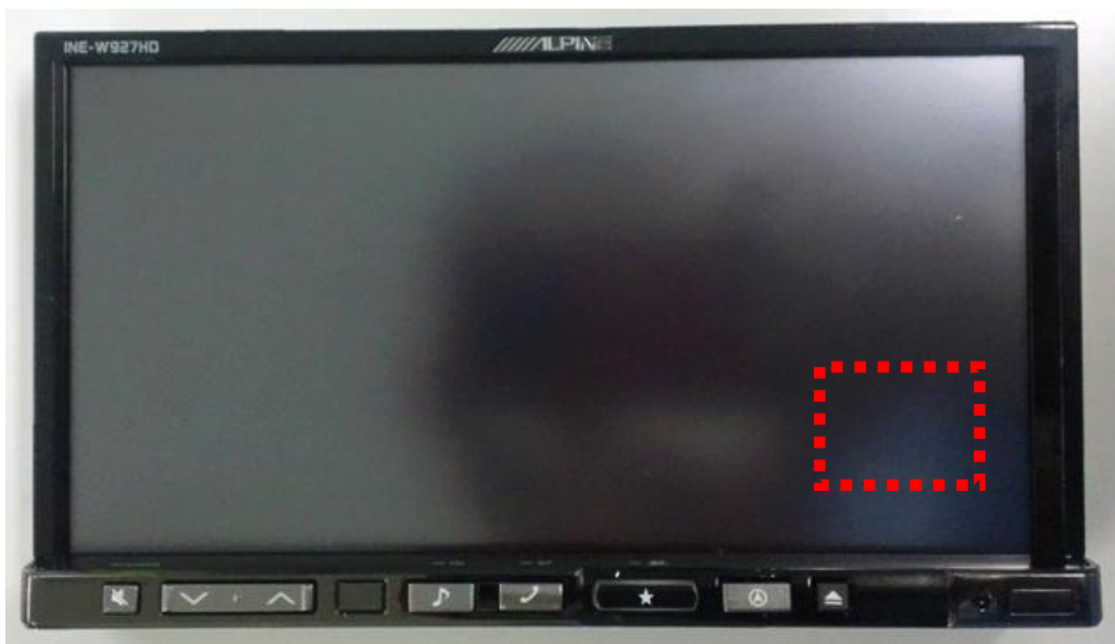
Fig 3. Front View of Display unit that installed Bluetooth Transmitter “UGZZC-B###”