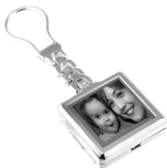
digital photo Keychain

Digital Photo Keychain Holds 100 photos 1.5" Display OLED Rechargeable Lithium Battery 4 different models