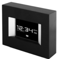
digital photo Clock

Digital Photo Frame & Clock Viewer 128 MB Internal Memory—1000 photos 3.5" Display 2 different models