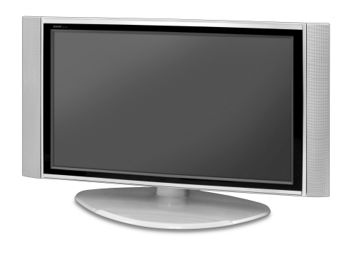
37" LCD TV