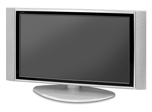
42" LCD TV