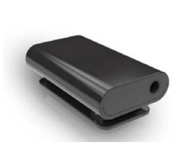
Item# BAR109 Bluetooth® Wireless Music Receiver