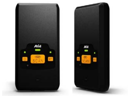
1. AT287-UHF Body

After opening the product packaging box, check the items listed as below: