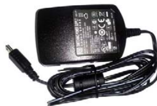
2. Adaptor and AC Cable