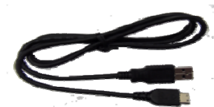
3. USB Sync Cable