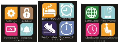
3160 UI ICONS