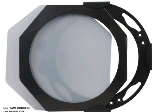
GEL FRAME HOLDER KIT SKU #LEV054-GFH