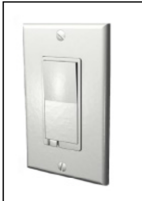
Shown with user supplied Decora™ trim plate