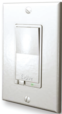
Shown with supplied Decora™ trim plate