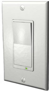
Shown with supplied Decora™ trim plate