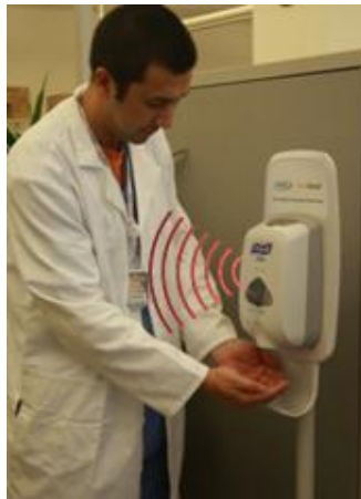
Figure 1: Embedded EX3300 triggering a staff tag

The EX3300 Exciters are specialty designed to be embedded in Hand Hygiene dispenser. When a dispenser with an embedded EX3300 Exciter is activated, the Exciters trigger AeroScout's tags that are located near the Exciter and the tags in turn transmit a message to AeroScout Location Receivers or compatible Access Points in range. This provides instant acknowledgment that a tagged staff member has used the dispenser. The AeroScout Visibility System can detect, record and report the rate of usage of the dispensers per user and provides a revolutionary way for health care facilities to monitor the hand hygiene policy compliance of staff members.