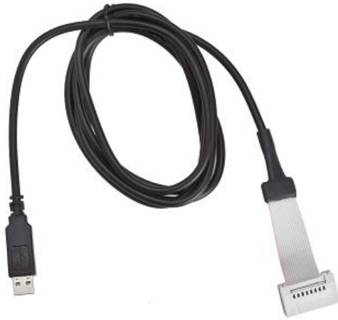
Figure 3: Customized EX3300 Serial Cable