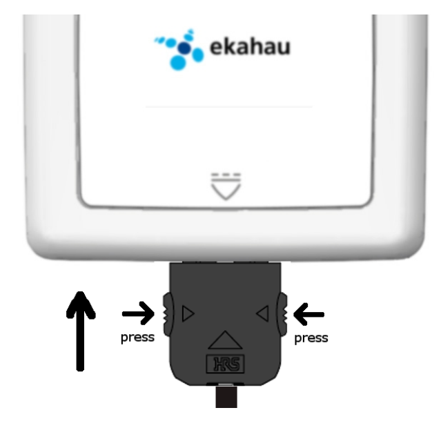
Figure 2.3. Connecting the tag with a charger.

The T301-B tag is delivered with the battery charged to a storage charge, and it is recommended to fully charge the batteries before first time activating the tag. To ensure the tag battery is full, please put the tag in to a charger for 4 hours. To remove the charger plug, release the plug by pressing the latches on the plug and pull the plug out.