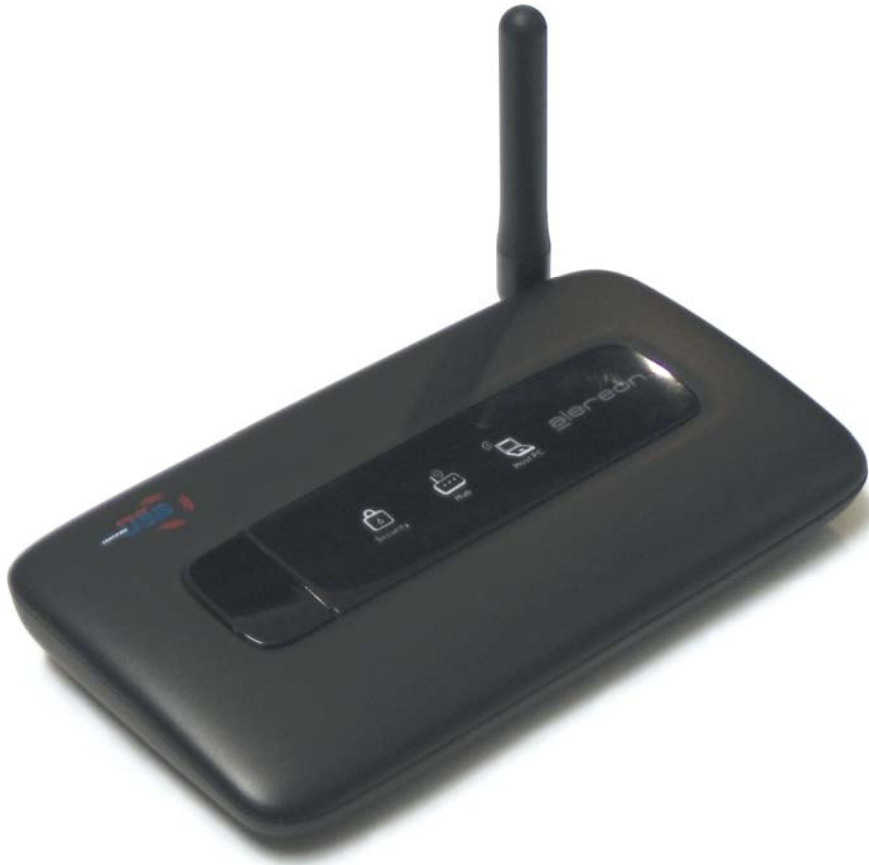
Figure 1. AL5612 enclosure