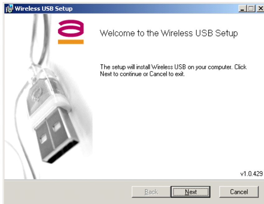
Figure 2. Wireless USB Installer