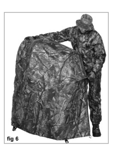
Step 3: Grab steel bands from behind chair and pull forward until blind is fully covering the chair (shown in figs 4, 5, 6)