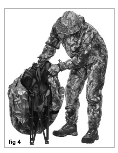
Step 1: Once out of the blind, lift the blind up and over the back of the chair so that the blind cover falls to behind the chair.