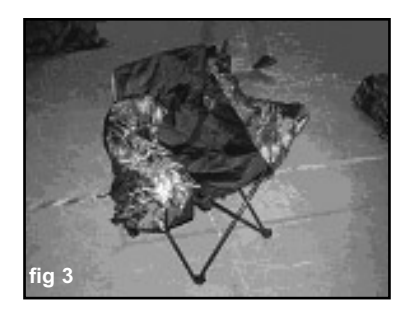
Step 2: Unsnap the cinch strap (fig 1 and 2) and open chair. (fig 3).