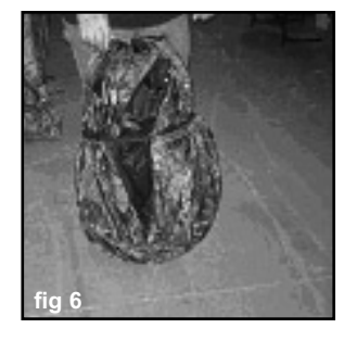
Step 3: Place cinch strap around the blind and snap together to keep Chair Blind closed.