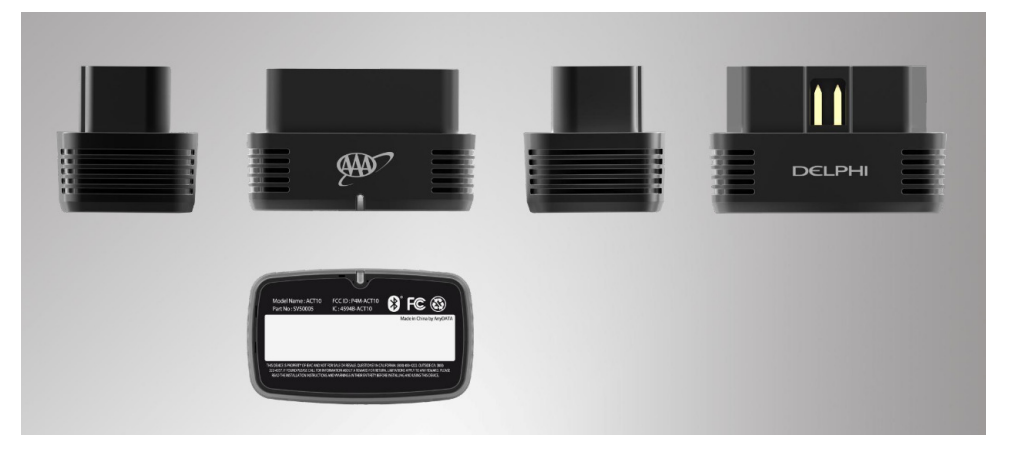
Figure 3.1: External Interface

The ACT10 adapted integrating Bluetooth Basic Rate(BR) / Enhanced Data Rate(EDR) / Low Energy(LE) features fully compliant with the Bluetooth 4.0 specification up to the HCI Layer. This device is connected to Smartphone by proper application program.