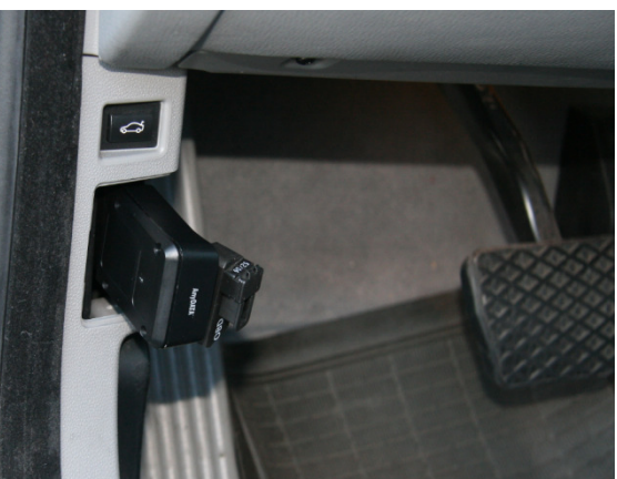
Figure 4.1: Installation of ACT10 in vehicle