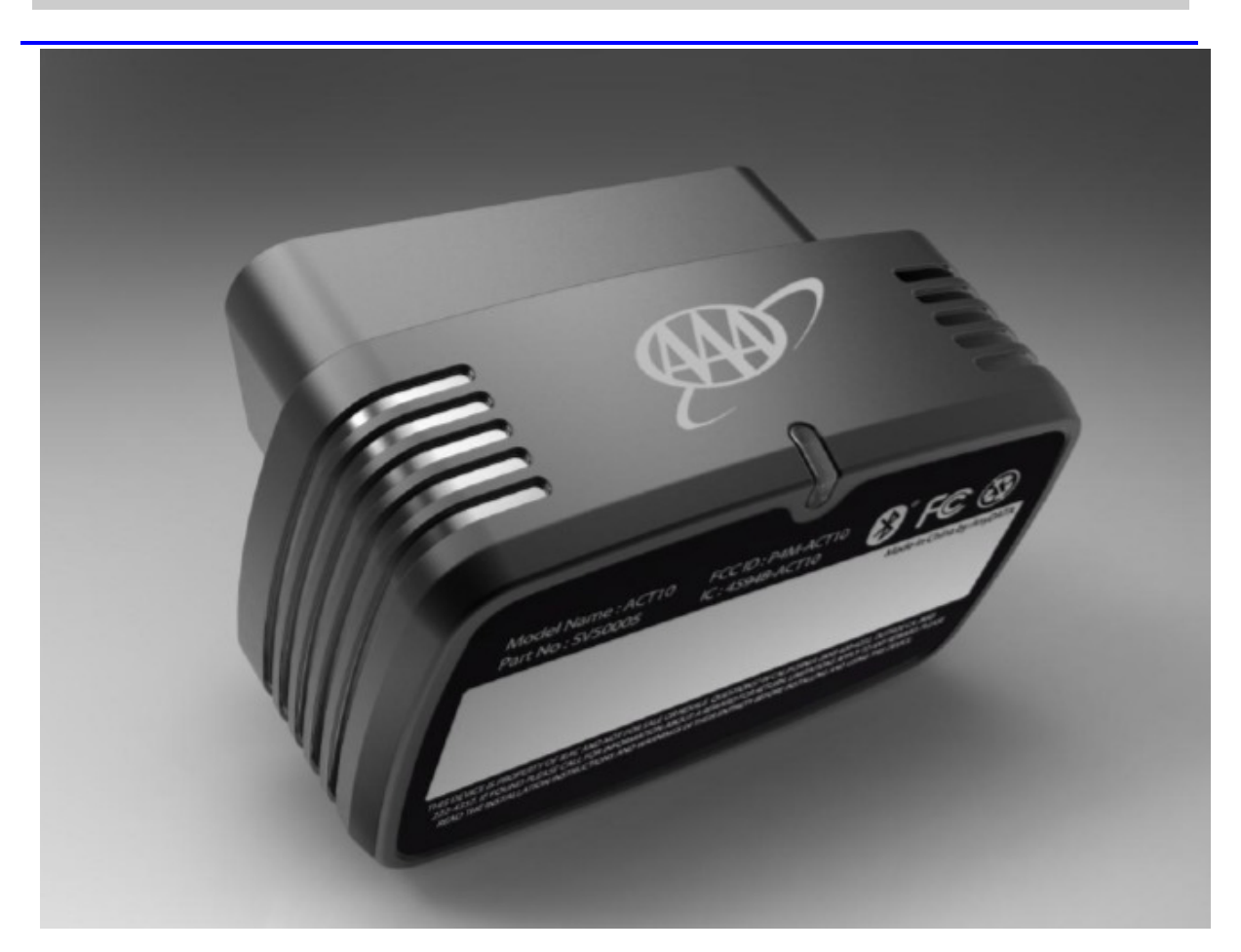
Figure 2.1: Package Contents