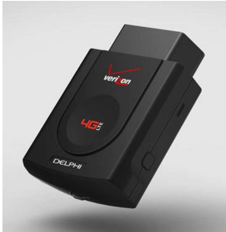
Figure 2.1: Package Contents