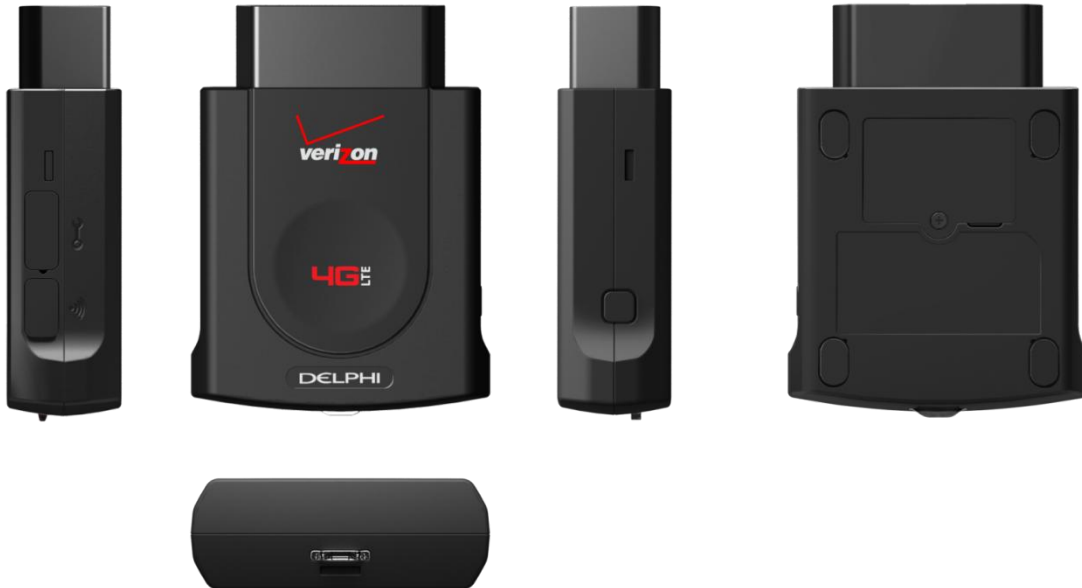
Figure 3.1: External Interface