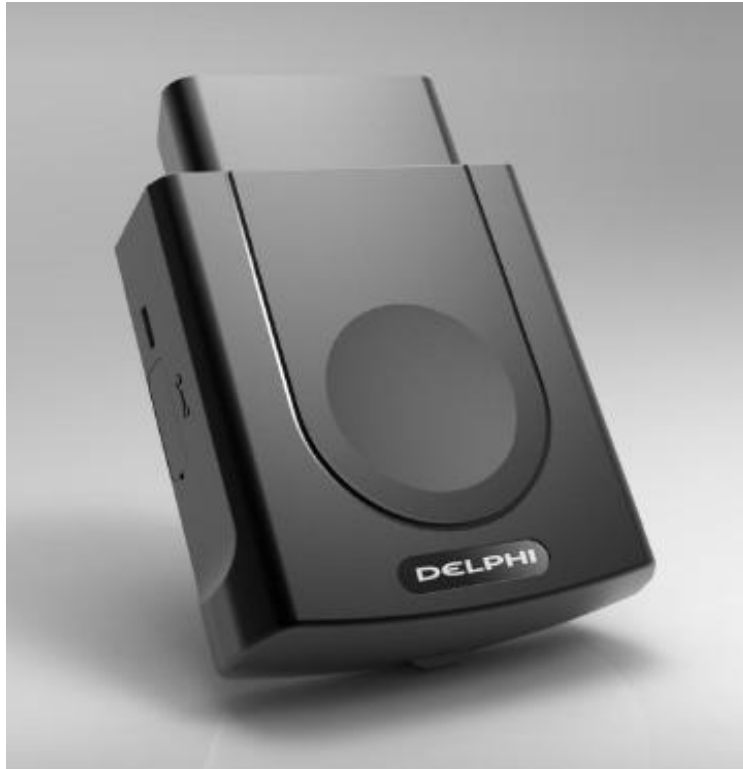
Figure 2.1: Package Contents