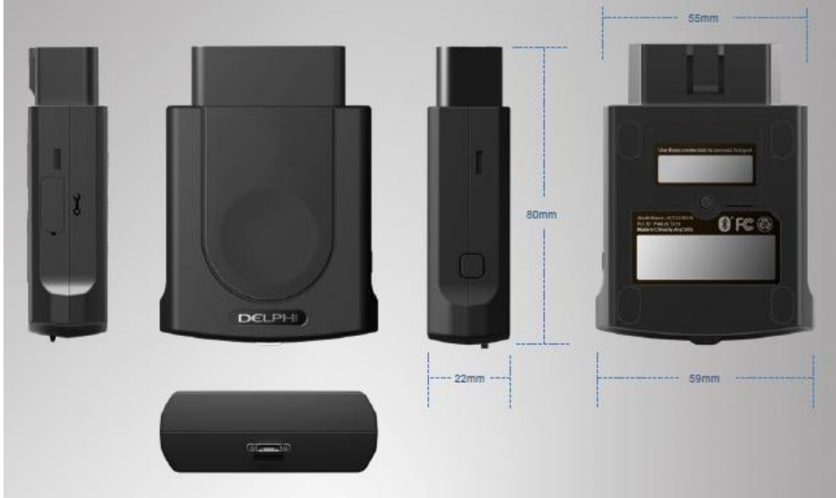
Figure 3.1: External Interface