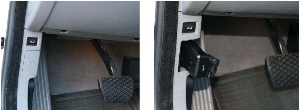
Figure 4.1: Installation of ACT233F in vehicle