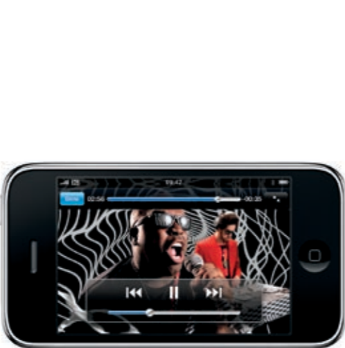
Run by Gnarl Barkley is available on iTunes.

Tap your movie to bring up onscreen controls. Tap again to hide them. Double-tapping switches between widescreen and full screen.