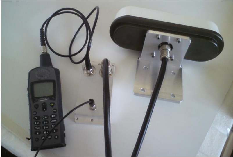
Figure 3. AD510-40 Power Break-In Box for use with +18 to +36 v DC supply.

The case is hard anodised aluminium and has fixing flanges. A 40m coil of RG213U cable is shown connected to an AD511 active antenna (top). The handset interconnect is shown trailing from the TNC to the bottom left, whilst the flying lead for connection to 18 to 36 v DC supply is shown cutting the frame to the left.