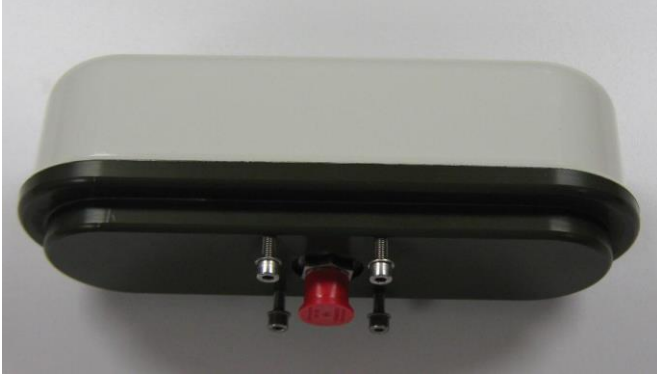
Figure 1. AD511 Active Iridium antenna