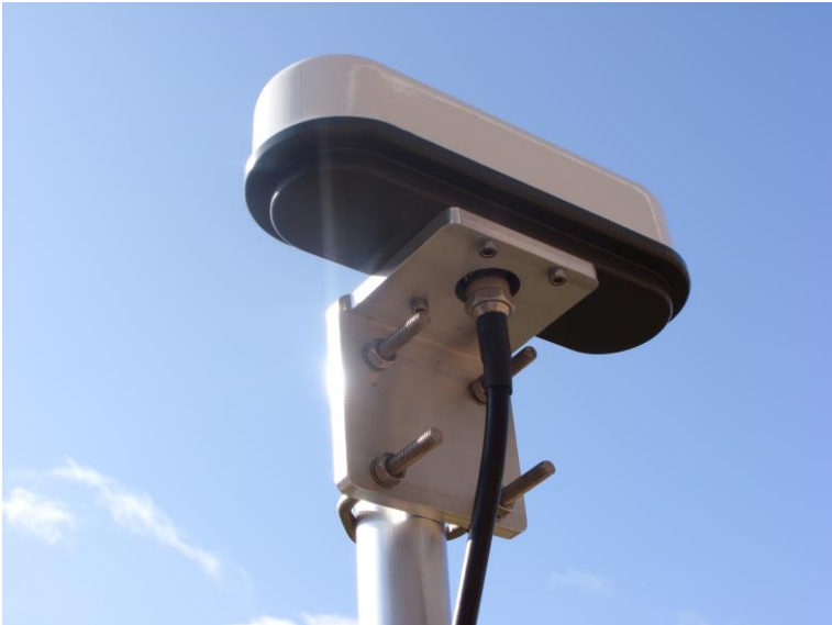
Figure 2. AD511 Active Iridium antenna with mounting bracket and coaxial down-lead