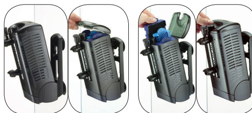
Tilt & Flip