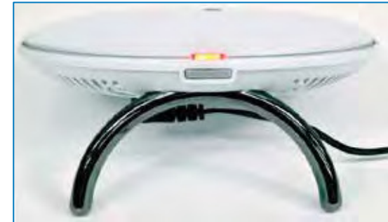
Figure 2: Red LED – Booster is ready for configuration