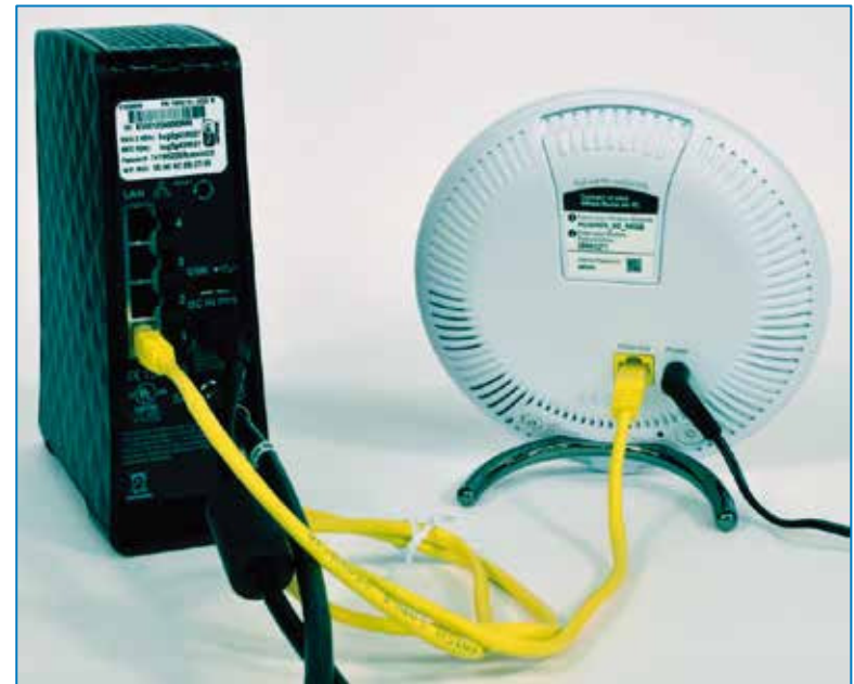
Figure 3: Connect the Booster to the HT2000W