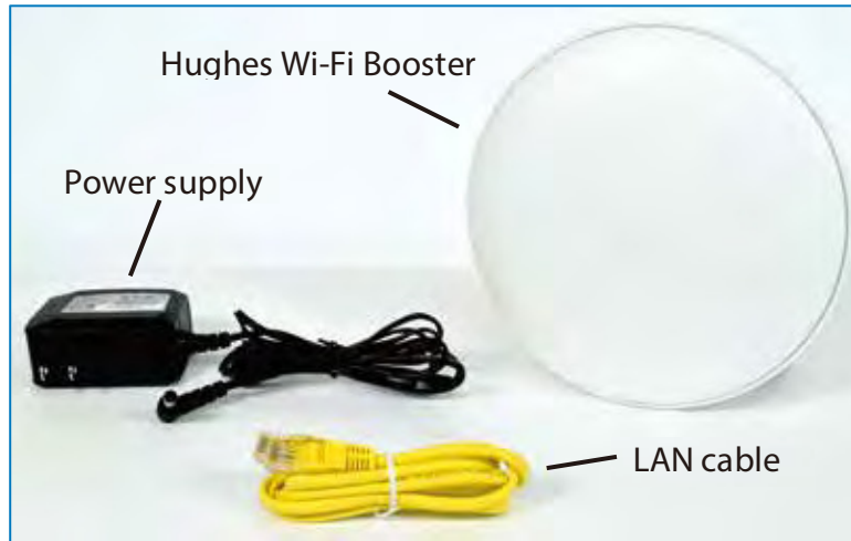
Figure 1: Box contents

Before you begin, make sure the box has the contents shown in Figure 1 .