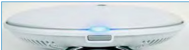
Figure 5: Blue LED – sync is complete