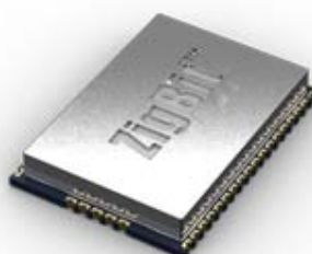
Figure 3-4. ATZB-900-B0

ATZB-900-B0 modules eliminate the need for costly and time-consuming RF development, minimizes bill of materials (BOM), and shortens time to market for a wide range of wireless applications, while embedded 802.15.4 / ZigBee software ensures standards-based wireless connectivity.