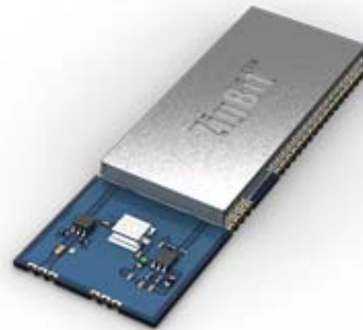
Figure 3-5. ATZB-A24-U0

ATZB-A24-U0 Module with Un-balanced RF Output minimizes bill of materials (BOM) and shortens time to market, while embedded 802.15.4/ ZigBee software ensures standards-based wireless connectivity for a wide range of applications.