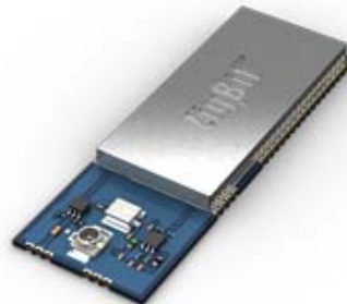
Figure 3-2. ATZB-A24-UFL

ZigBit Amp ATZB-A24-UFL is an amplified IEEE 802.15.4/ZigBee module. Its unique RF design achieves a rare combination of the industry-leading range performance and low power consumption. The ATZB-A24-UFL module's small footprint of less than a square inch of space makes the integration easy, with the built-in U.FL antenna connector.