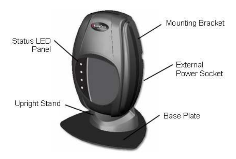
Figure 1 Home Unit