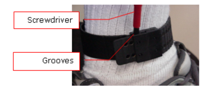
Figure 5 Dismantling the Transmitter Clip

Being careful not to damage or cut the strap, insert a screwdriver into the grooves of the clip and gently pry the clip pieces apart.