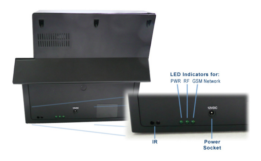
Figure 3 Installing the MEMS3000 Receiver

After you locate a suitable location for the MEMS3000 Receiver, connect the unit to a power source and set up the breath tube.