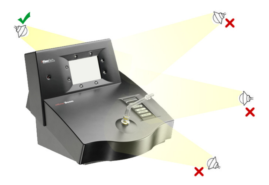
Figure 2 Positioning the MEMS3000 Receiver

Direct light in front of the mirror or any backlighting behind the person whose picture is taken (as indicated by the \times in the diagram below) may cause severe reflections in the picture.