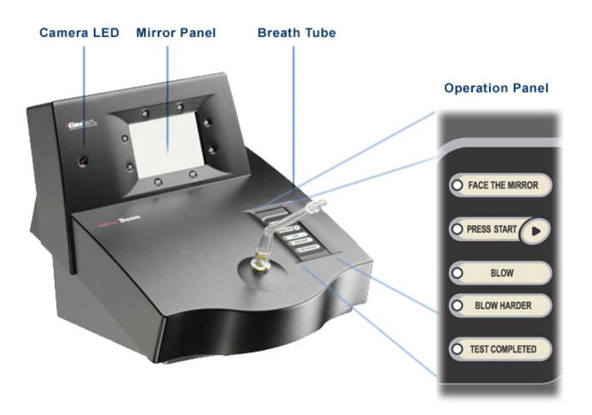
Figure 4 Performing an On-Demand Test

When the Offender performs an on-demand test, the Receiver emits the Test Request beep and the Press Start LED turns on.