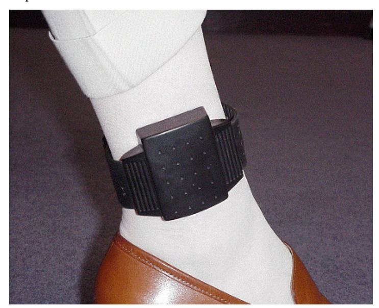
Figure 3 Protruding side of Transmitter directed upwards

3. Wrap the Transmitter around the offender's ankle at its narrowest point. Ensure that the protruding side of the Transmitter is directed upwards.