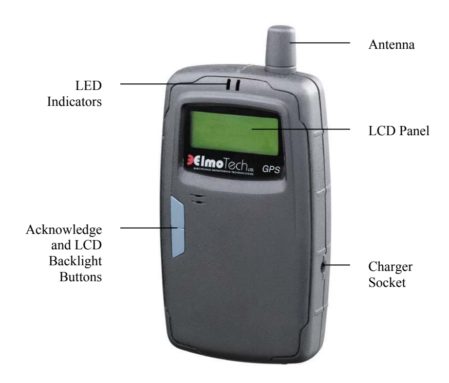
Figure 2 The STaR Unit