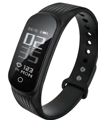
Smart bracelet MRASW-WP112