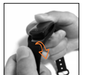
2. Pull down the bracelet from the touching button side.