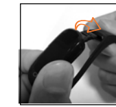
5. Insert the USB charging interface.