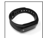
1. Prepare your bracelet.