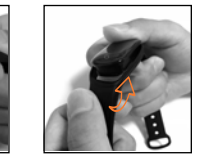
6. Pull up the bracelet.