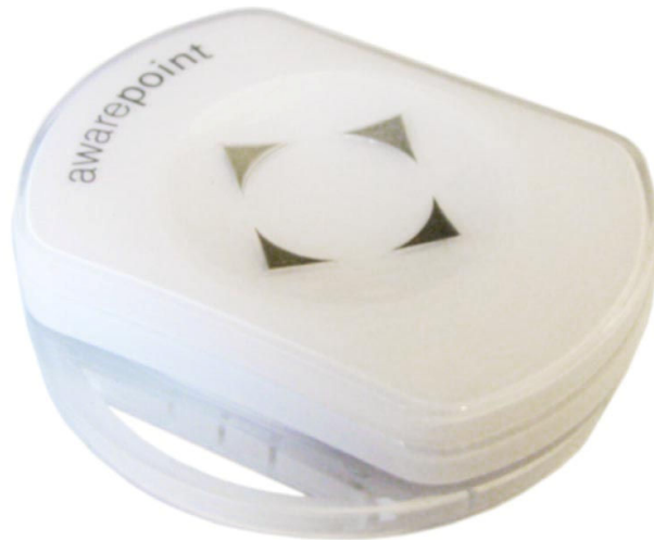
Figure 2: Tag, with optional strap base