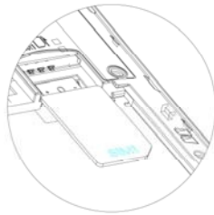
SIM Card Slot