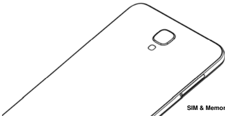
SIM & Memory Card Slot