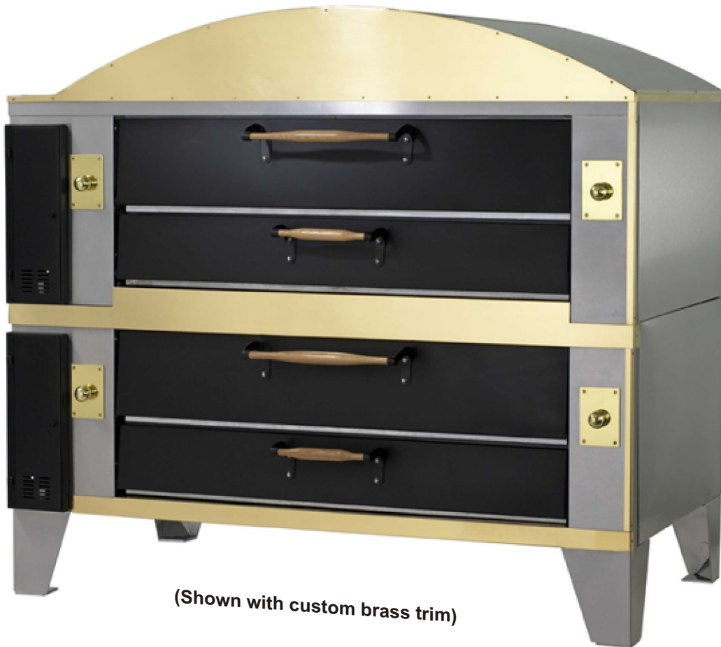
(Shown with custom brass trim)