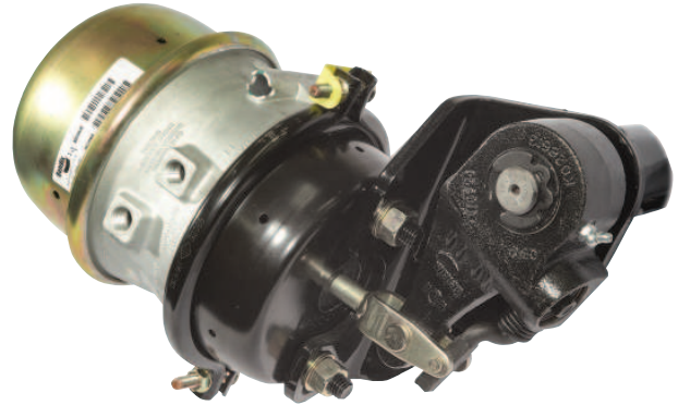
EverSure® Spring Brake with welded clevis

Bendix brand spring brakes and service chambers are brought to you by Bendix Spicer Foundation Brake (BSFB), your single complete source for brake system design, manufacturing, hardware and support for all foundation drum components and actuation systems.