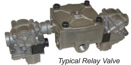
Typical Relay Valve Axle Module Assembly

Beginning December 1, 2009, Relay Valve Axle Modules that contain the R-12®, R-12DC® or R-14® relay valve will no longer be available as service replacement modules. Instead, the individual valves, R-12®, R-12DC®, R-14®, and M-32™ will available.