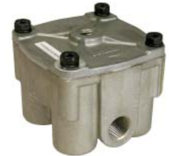
Typical Bendix® R-12® Relay Valve