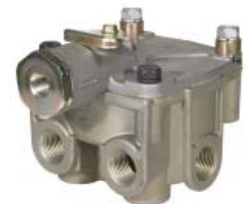
Typical Bendix® R-14® Relay Valve