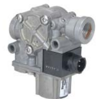
Typical Bendix® M-32® Modulator