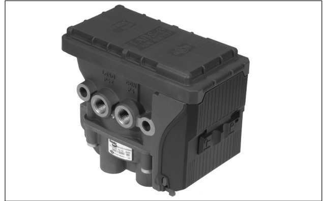
FIGURE 2 - TABS-6 ADVANCED SINGLE-CHANNEL MODULE (TABS-6 ADV)

Note: Bendix TABS-6 Advanced update packages are only able to be programmed into the ABS module using the SAE J1939 interface. Contact your Bendix representative to find out more about update packages.