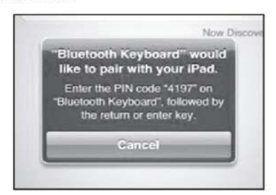
Step 6: Enter the password code as displayed On screen

Step 7: Password accepted and Bluetooth keyboard connected Successfully. [power] indicator light will stay on until the keyboard is switched off