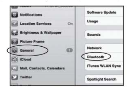
Step 4:Click on [Bluetooth] to turn on the connection. iPad will automatically search Bluetooth devices Step 5: Bluetooth Keyboard found. Click on the device to connect