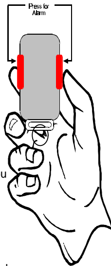
Figure 1. Transmitting an Alarm

Once initiated, the transmitter will send a signal every few seconds updating your location until a test is performed.