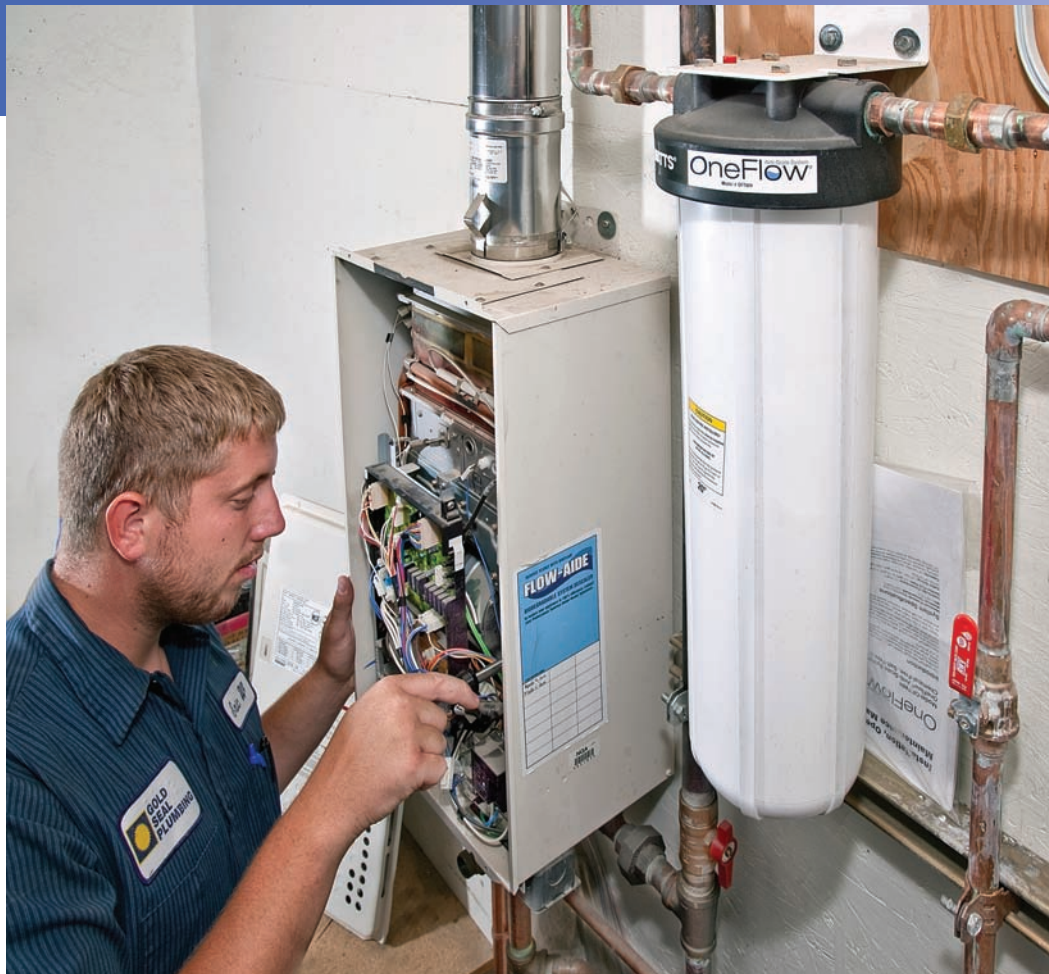
Left: A Gold Seal technician works on an instantaneous water heater. A Watts OneFlow water treatment system protects the unit's heat exchanger from mineral deposits.

ing systems without latching on to pipes, fixtures, valves or heating elements and are available in many connection sizes to meet flow rates from 0.5 to 450 gpm or more.