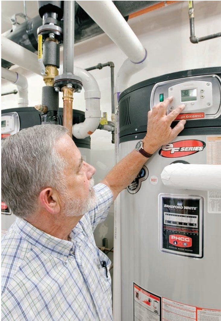
A facility manager sets the function of an eF water heater installed by Gold Seal Mechanical.

Year after year, decade after decade, the clients continue to call on Gold Seal because they've earned the symbol of excellence, and substantiate the chosen name.