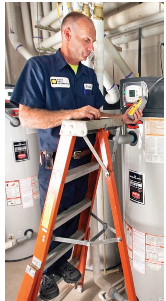
Below: A Gold Seal supervisor performs an annual maintenance check on one of many Bradford White eF water heaters at the Affinity independent living community.

through the Davenport Hotel walk in the footsteps of film stars, explorers, famous writers and politicians including Charles Lindbergh, Amelia Earhart, Clark Gable, Bob Hope, Bing Crosby, John F. Kennedy, Babe Ruth, John Travolta and Ringo Starr.