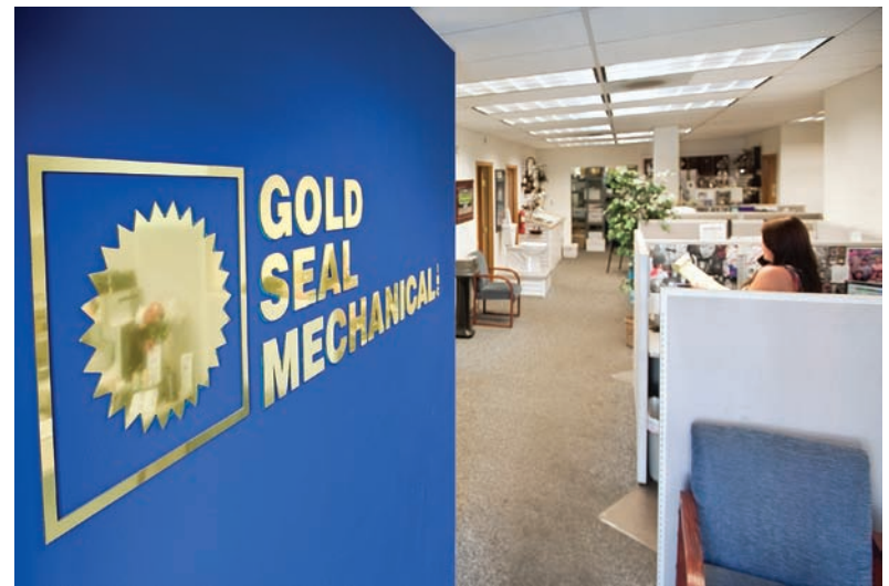
Gold Seal Mechanical celebrates its 50th year of business this year.