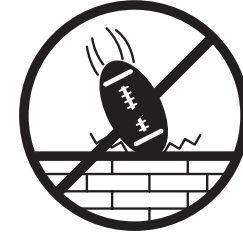
NO HARD SURFACES