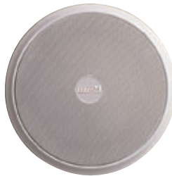
CS-03/03A/05 CS-20/30/80 CS-3/6/12 CS-10/44/45