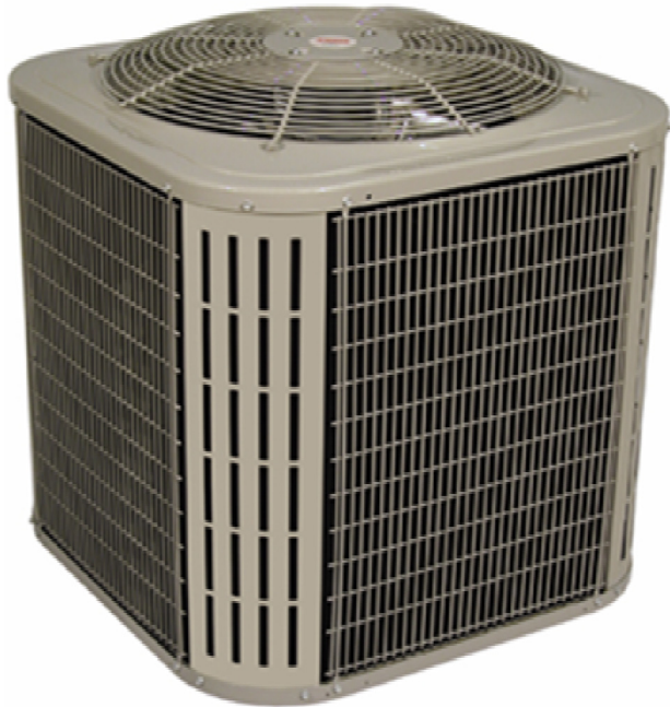
Fig. 1 – 213A

Bryant's heat pumps with Puron® refrigerant provide a collection of features unmatched by any other family of equipment. The 213A has been designed utilizing Bryant's Puron refrigerant. The environmentally sound refrigerant allows consumers to make a responsible decision in the protection of the earth's ozone layer.