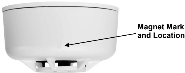
Figure 4: Magnet Mark

Note: Notify central station before any live testing to avoid fire response. The magnet test allows the sensor to send an actual alarm signal to the control panel, if a magnet is held against the housing for 15 seconds.