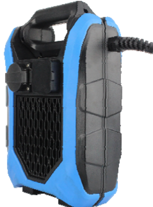
The other side